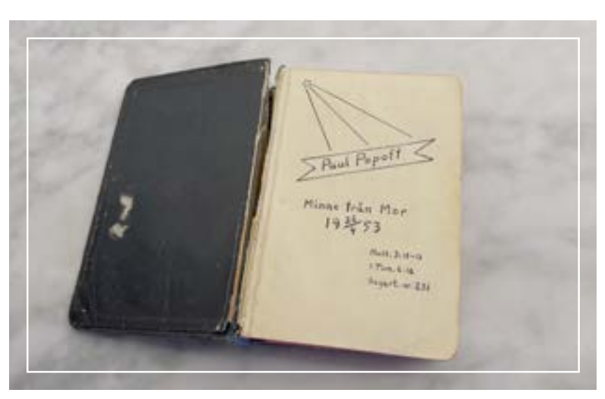
In memory from mom, April 26, 1953, 1 Tim 6:12

"Fight the good fight of faith, lay hold on eternal life, whereunto thou art also called, and hast professed a good profession before many witnesses."