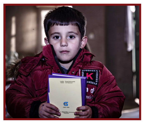
Please help provide children's New Testaments to Armenian refugees from Nagorno-Karabakh.

Originally Nagorno-Karabakh was land owned by the king of Armenia. In 1924 it became a region within the Soviet-defined borders of Azerbaijan. Since the fall of the Soviet Union, Armenia has been trying to reclaim its territory and people.