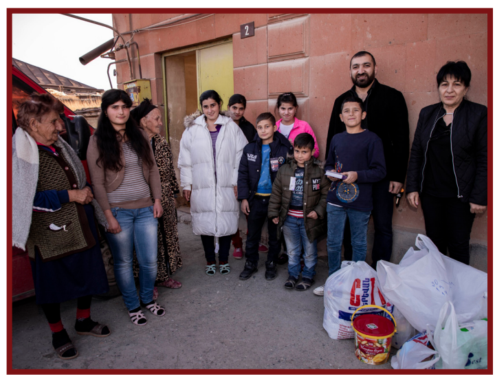
Nagorno-Karabakh refugees receiving food, shelter and clothing in Armenia

During the war we immediately arranged urgent shelter and relief packages for those who fled their homes. Within each care package we included Bibles and children's Bibles. They were received with such gratitude. We saw how the Evangelical Churches came together to minister to the hurting, devastated and lost people. In the midst of this, their most difficult time of need, many gave their lives to the Lord.